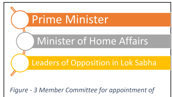
Figure - 3 Member Committee for appointment of

The Central Vigilance Commission investigates corruption, recommends action, promotes vigilance, protects whistle-blower, but needs strengthening, enhanced authority, and address limitations for greater impact.