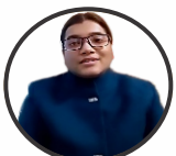
Ritu AIR-739 (4301786)