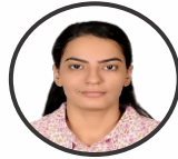
Ruhani AIR-159 (6306005)